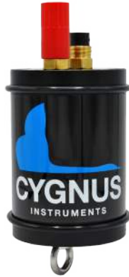
CYGNUS ROV MOUNTABLE