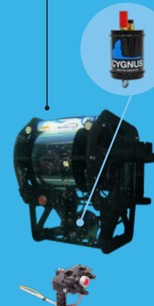
PROBE HANDLER G1 (optional)

Call our team today on +44 (0) 1305 265 533 for expert product advice