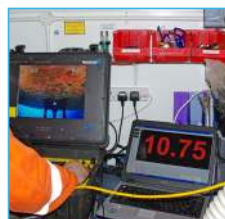
SURFACE DISPLAY OF MEASUREMENTS