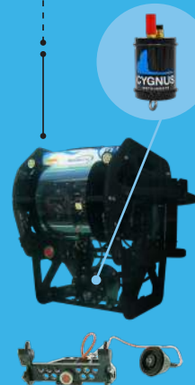
PROBE HANDLER S1 (optional)