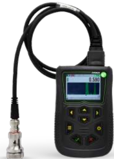
CYGNUS 6+ PRO