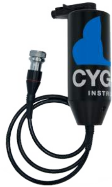
CYGNUS MINI ROV MOUNTABLE