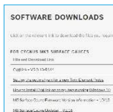
DOWNLOAD FROM OUR WEBSITE

Visit www.cygnus-instruments.com to explore our full product range