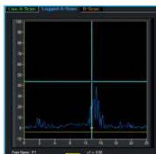
A-SCANS ANALYSIS CAPABILITY