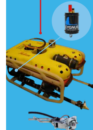
PROBE HANDLER W1 (optional)