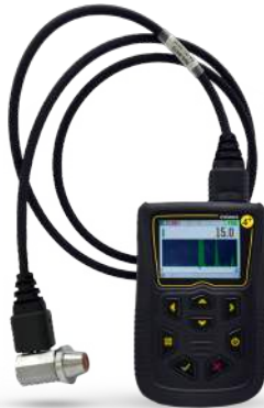
CYGNUS 4+ GENERAL PURPOSE